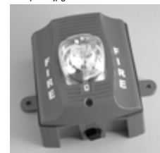
Outdoor Wall Strobe