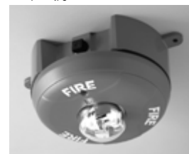
Outdoor Ceiling Strobe