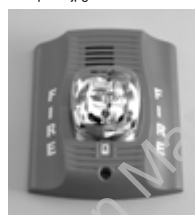
Indoor Wall Horn/Strobe