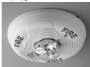
Indoor Ceiling Horn/Strobe