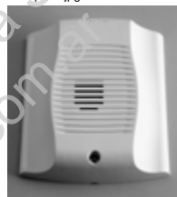
Indoor Wall Horn