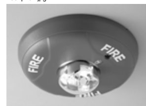
Indoor Ceiling Strobe