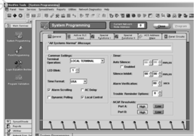
VeriFire Tools System Programming screen

L1:30 DETS, 15 MODS L2:93 DETS, 35 MODS PANEL OUTPUTS:24 BELLS: 04