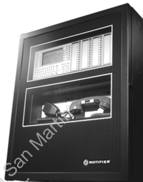
NFS-640 shown in CAB-B4 with NCA 640-character display.