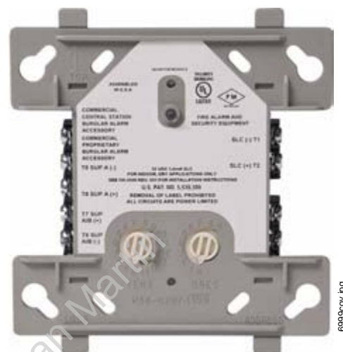
FMM-1 (Type H)

Use to monitor a zone of four-wire smoke detectors, manual fire alarm pull stations, waterflow devices, or other normally-open dry-contact alarm activation devices. May also be used to monitor normally-open supervisory devices with special supervisory indication at the control panel. Monitored circuit may be wired as an NFPA Style B (Class B) or Style D (Class